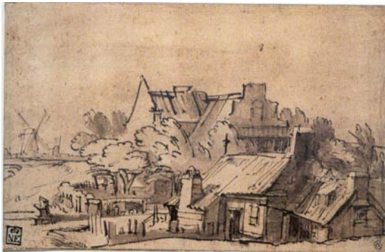
Rembrandt, Bulwark "The Rose" (Szépművészeti Múzeum, Budapest)

Exhibition illuminates 30 years of scholarship defining the stylistic differences between drawings by Rembrandt and those of his pupils, –featuring momentous international loans