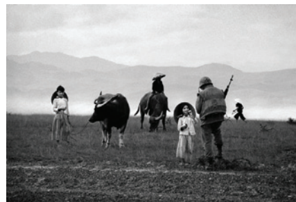
8. Philip Jones Griffiths Welsh, 1936–2008 Vietnam, 1967 Limits of friendship. A Marine introduces a peasant girl to king-sized filter-tips. Of all the U.S. forces in Vietnam, it was the Marines that approached "Civic Action" with gusto. From their barrage of handouts, one discovers that, in the month of January 1967 alone, they gave away to the Vietnamese 101,535 pounds of food, 4,810 pounds of soap, 14,662 books and magazines, 106 pounds of candy, 1,215 toys, and 1 midwifery kit. In the same month they gave the Vietnamese 530 free haircuts. Gelatin silver print Image: 21.3 x 31.8 cm (8 3/8 x 12 1/2 in.) The J. Paul Getty Museum, Los Angeles © The Philip Jones Griffiths Foundation / Magnum Photos 2010.3.2