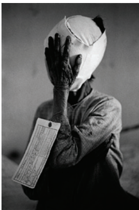
7. Philip Jones Griffiths Welsh, 1936–2008 Quang Ngai, Vietnam, 1967 Quaker amputee center. This woman was tagged, probably by a sympathetic corpsman, with the designation VNC (Vietnamese civilian). This was unusual. Wounded civilians were normally tagged VCS (Vietcong suspect) and all dead peasants were posthumously elevated to the rank of VCC (Vietcong confirmed). Gelatin silver print Image: 28.4 x 19.2 cm (11 3/16 x 7 9/16 in.) The J. Paul Getty Museum, Los Angeles 2010.3.1