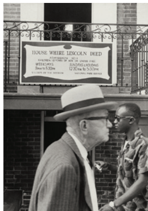
2. Leonard Freed American, 1929–2006 Washington, D.C., 1963 Gelatin silver print Image: 27.8 x 19.8 cm (10 15/16 x 7 13/16 in.) The J. Paul Getty Museum, Los Angeles 2008.62.21