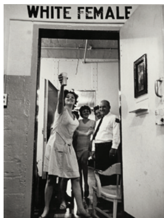
3. Leonard Freed American, 1929–2006 New Orleans, Louisiana, 1965 Gelatin silver print Image: 34.8 x 26.1 cm (13 11/16 x 10 1/4 in.) The J. Paul Getty Museum, Los Angeles 2008.62.36