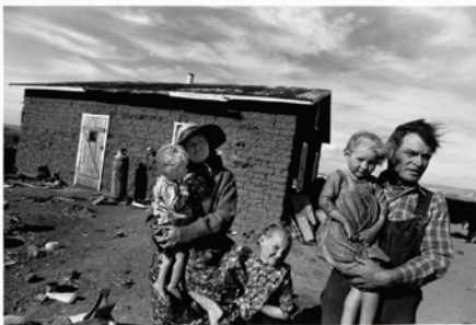
19. Larry Towell Canadian, born 1953 El Cuervo (Casas Grandes Colonias), Chihuahua, Mexico , Negative:1992; Print: 1999 Gelatin silver print Image: 31.1 x 46.8 cm (12 1/4 x 18 7/16 in.) The J. Paul Getty Museum, Los Angeles 2010.4.2