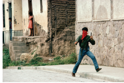
12. Susan Meiselas American, born 1948 First day of the popular insurrection, August 26, 1978, Matagalpa, Nicaragua, Negative: 1978; Print: 1980s Dye destruction print Image: 33 x 49.5 cm (13 x 19 1/2 in.) The J. Paul Getty Museum, Los Angeles 2010.5.7