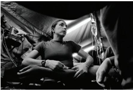
13. James Nachtwey American, born 1948 The Sacrifice (detail), 2007 Inkjet print Sheet: 111.8 x 983 cm (44 x 387 in.) James Nachtwey, New York, New York EX.2010.4.89