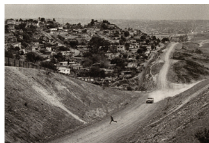
16. Sebastião Salgado Brazilian, born 1944 Desert of San Ysidro, California, Negative 1997; Print: 2009 Gelatin silver print Image: 34.4 x 51.4 cm (13 9/16 x 20 1/4 in.) The J. Paul Getty Museum, Los Angeles 2009.33.11