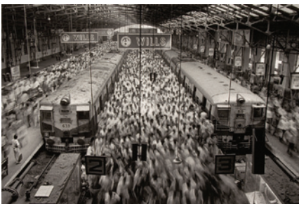
15. Sebastião Salgado Brazilian, born 1944 Church Gate Station, Western Railroad Line, Bombay, India, Negative: 1995; Print: 2009 Gelatin silver print Image: 34.3 x 51.4 cm (13 1/2 x 20 1/4 in.) The J. Paul Getty Museum, Los Angeles 2009.33.1