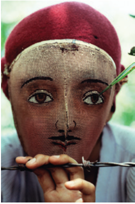
11. Susan Meiselas American, born 1948 Traditional Indian dance mask adopted by the rebels during the fight against Somoza, Nicaragua, Negative: 1978; Print: 1980s Dye destruction print Image: 49.5 x 33 cm (19 1/2 x 13 in.) The J. Paul Getty Museum, Los Angeles 2010.5.2