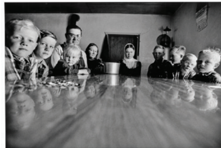
20. Larry Towell Canadian, born 1953 La Batea Colony, Zacatecas, Mexico , Negative:1994; Print: 1999 Gelatin silver print Image: 31.4 x 46.5 cm (12 3/8 x 18 5/16 in.) The J. Paul Getty Museum, Los Angeles 2010.4.3