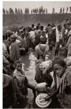
14. Sebastião Salgado Brazilian, born 1944 Tanzania, Negative: 1994; Print: 2009 Gelatin silver print Image: 51.4 x 34.1 cm (20 1/4 x 13 7/16 in.) The J. Paul Getty Museum, Los Angeles 2009.33.8