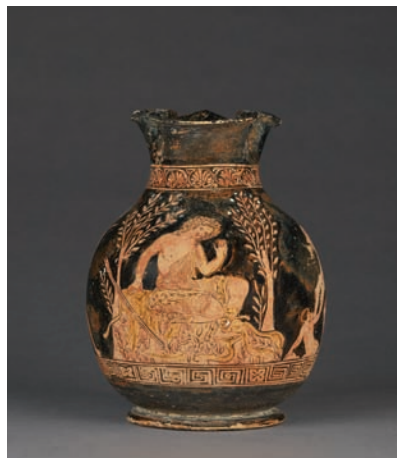
4. Wine Jug with Kallisto Turning into a Bear Greek (Apulian), about 360 B.C. Attributed to near the Black Fury Group Terracotta Object: H: 16.8 x Diam. [rim]: 8.4 cm (6 5/8 x 3 5/16 in.) The J. Paul Getty Museum, Villa Collection, Malibu, California 72.AE.128