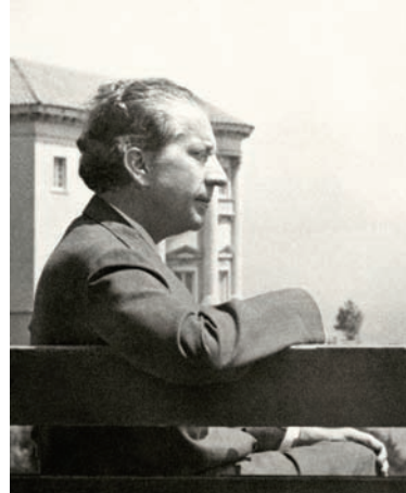
8. J. Paul Getty at Inspiration Point, Malibu, 1947 Institutional Archives, The Getty Research Institute, Los Angeles (1986.IA.10)