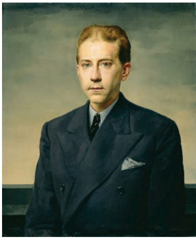
5. Gerald L. Brockhurst English, 1890–1978 Portrait of J. Paul Getty, 1938 Oil on canvas 73.7 x 61 cm (29 x 24 in.) The J. Paul Getty Museum, Los Angeles 67.PA.2