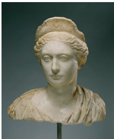
1. Bust of a Woman Roman, about 130 A.D. Marble H: 43 x W: 42.1 x D (head): 24 cm (H: 16 15/16 x W: 16 9/16 x D (head): 9 7/16 in.) The J. Paul Getty Museum, Villa Collection, Malibu, California 70.AA.100