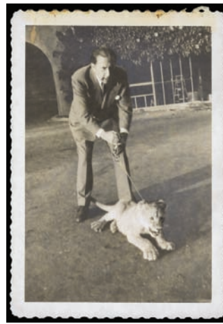
6. J. Paul Getty with his lioness cub Teresa in Malibu, late 1940s