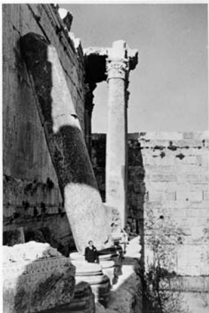
7. J. Paul Getty at the archaeological site of Baalbek, Lebanon, 1954